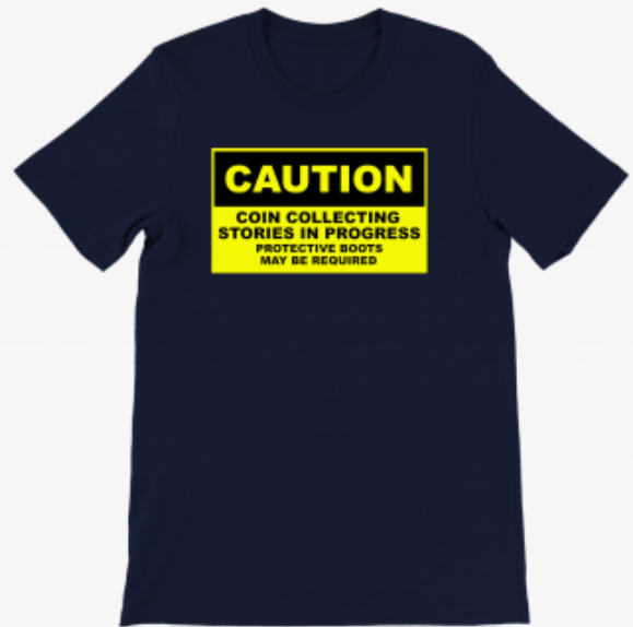
Front - Navy

COIN COLLECTING STORIES IN PROGRESS PROTECTIVE BOOTS MAY BE REQUIRED