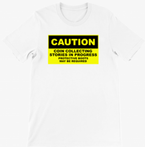
Front - White