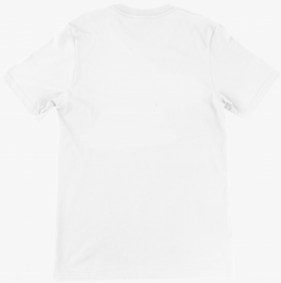
Back - White