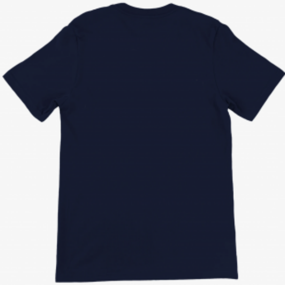
Back - Navy