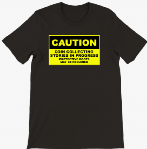
Front - Black