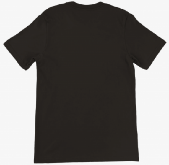
Back - Black