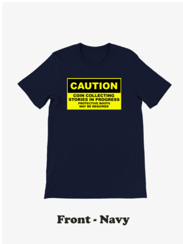
Front - Navy

Brand: Gelato Product Code: Caution_CoinCollectingT Availability: 1000 Weight: 0.50lb Dimensions: 10.00in x 10.00in x 1.00in